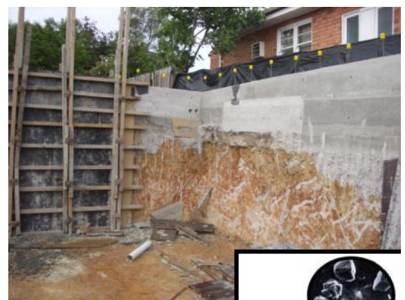
Adding C1 to the floor slab adds protection