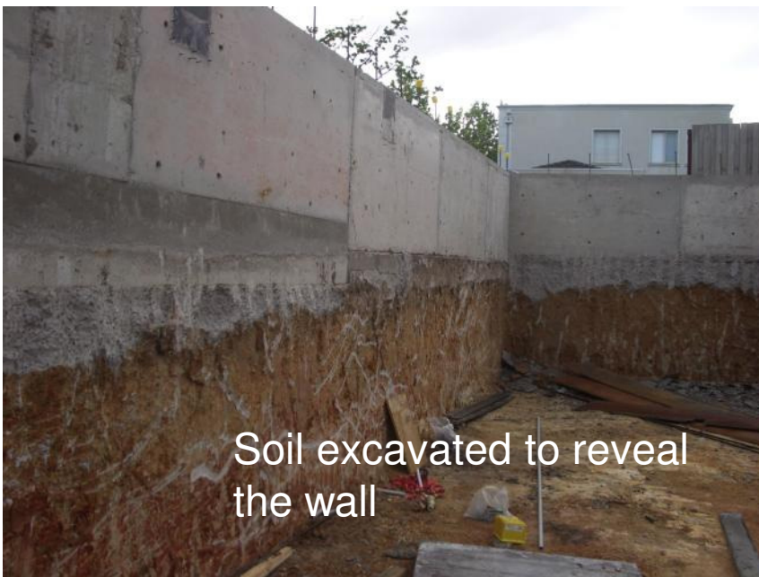
Soil excavated to reveal the wall