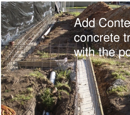
Add Contec C1 to the concrete truck on site with the pour