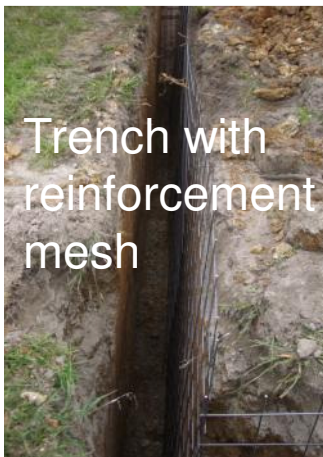
Trench with reinforcement mesh