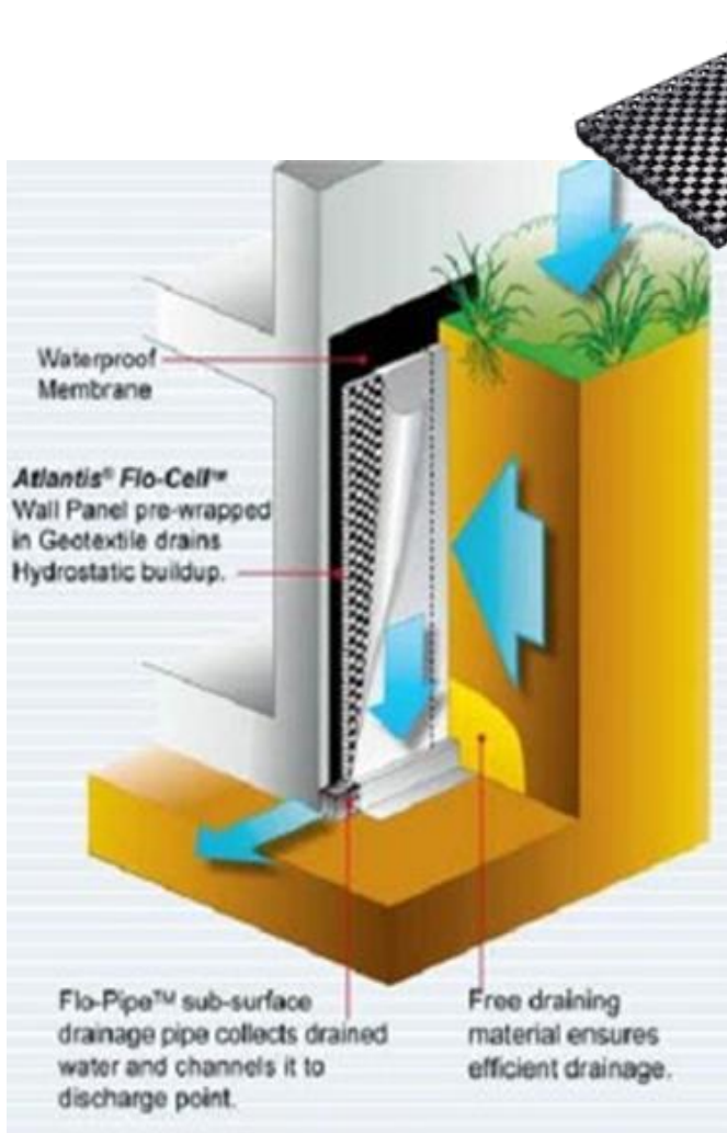
30mm Drainage Cell