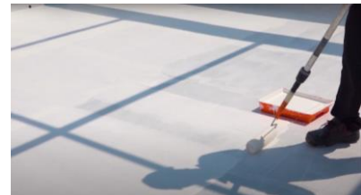
Apply second coat of Top Coat to provide full coverage, gloss finish