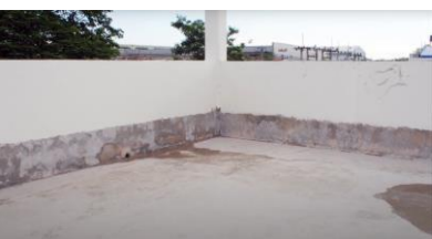
Clean and prepare substrate