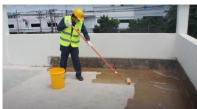
Apply moisture barrier primer coat