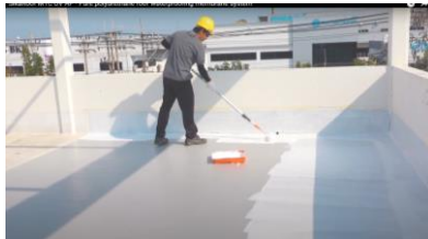
Apply first coat of Top coat - Sikalastic 701