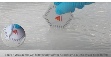
Check WFT a min of 280 microns