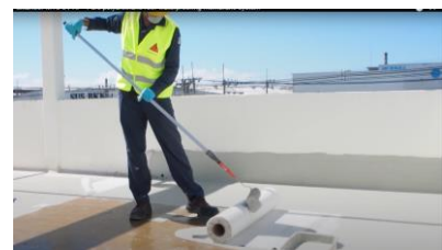
Apply Base Coat, with Fleece reinforcing optional