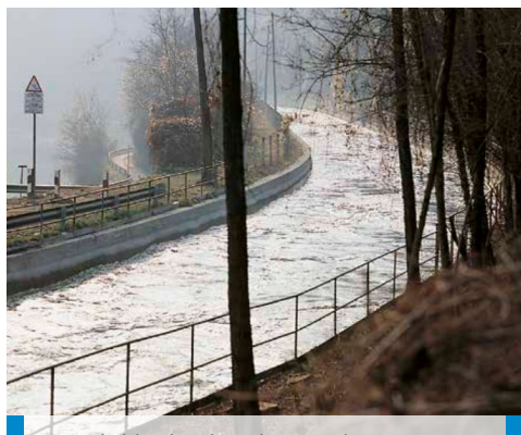
Bertini hydroelectric canal - Como -Italy. Surfaces treated with Planiseal 88